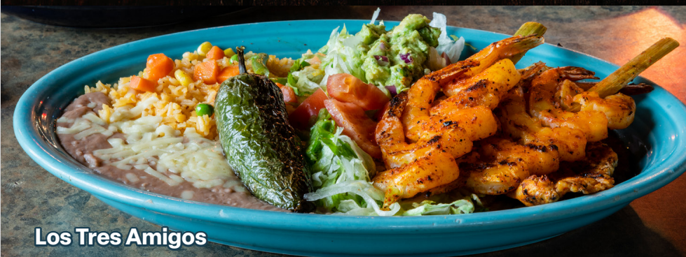
Los Tres Amigos

Cheese nachos topped with ground beef, chicken and fried beans. All covered with shredded lettuce, tomatoes and sour cream – 15.00