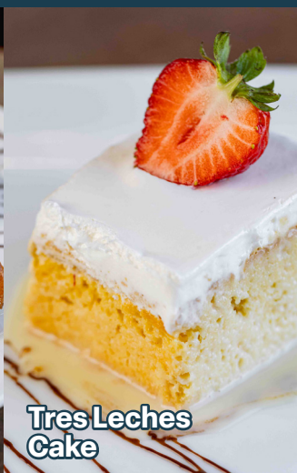
Tres Leches Cake