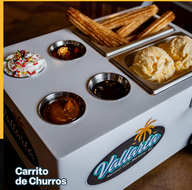
Carrito de Churros

Mexican churros topped with whipped cream and served with ice cream and dipping sauce - 15.00