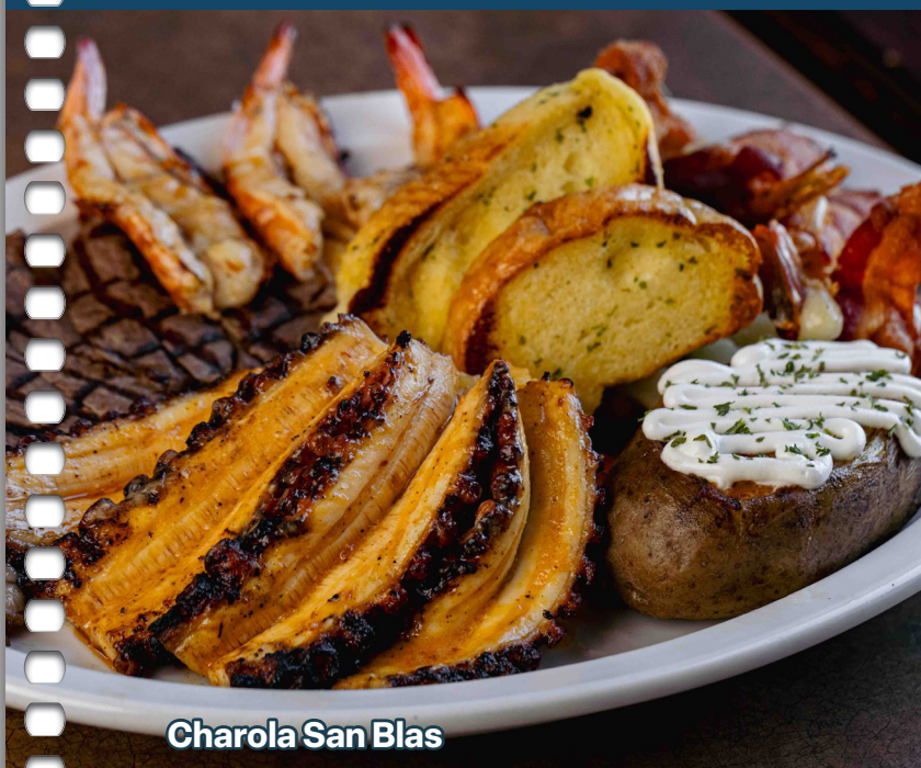
Charola San Blas

Cold stone bowl filled with our seafood mix, marinated in lime juice and tossed in our signature Culichi sauce. Garnished with cucumbers, red onions and avocado slices – 38.00